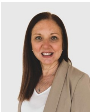
Co-presenter for “DH Clinical Calibration Workshop”