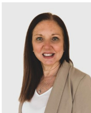
Co-presenter for “DH Clinical Calibration Workshop”